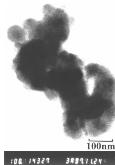
Fig. 2 TEM image of the CdS sample shown in Fig. 1